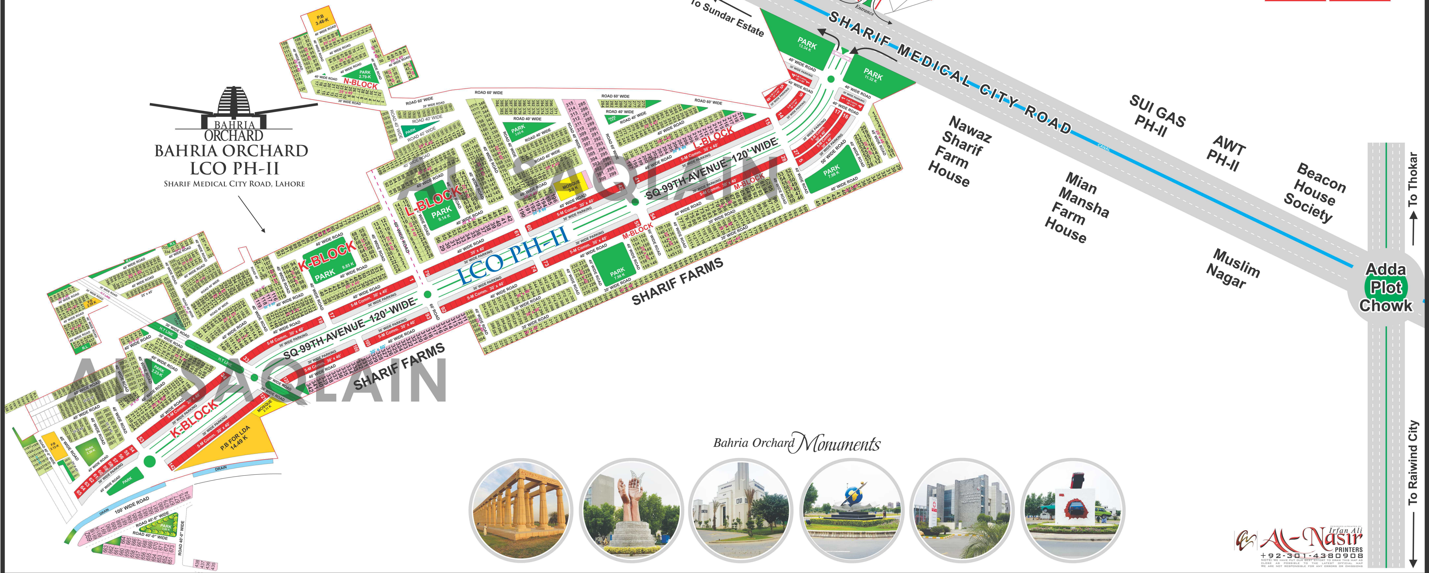
Bahria Orchard Monuments

BAHRIA ORCHARD BAHRIA ORCHARD LCO PH-II SHARIF MEDICAL CITY ROAD, LAHORE